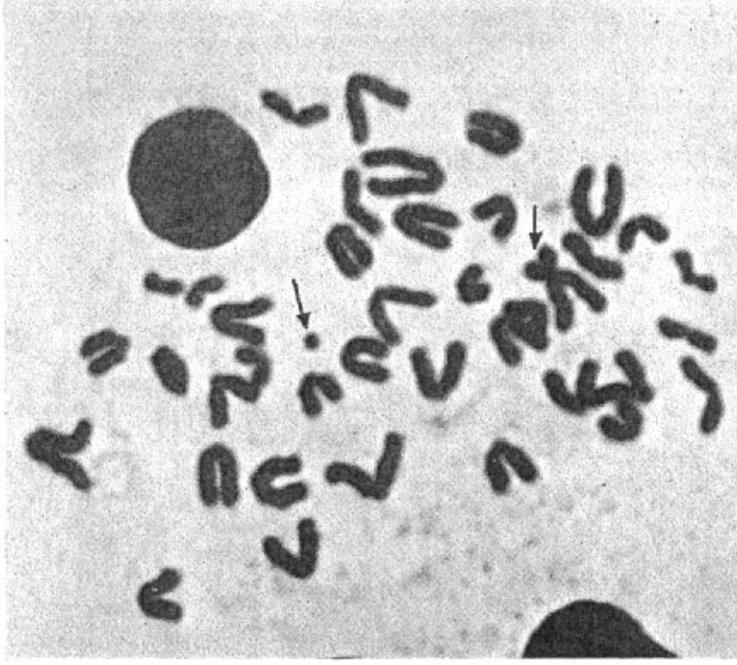
FIG. 2. Two chromosomes visibly atypical (1 large metacentric, 1 small acrocentric). M.1582. \times 2280